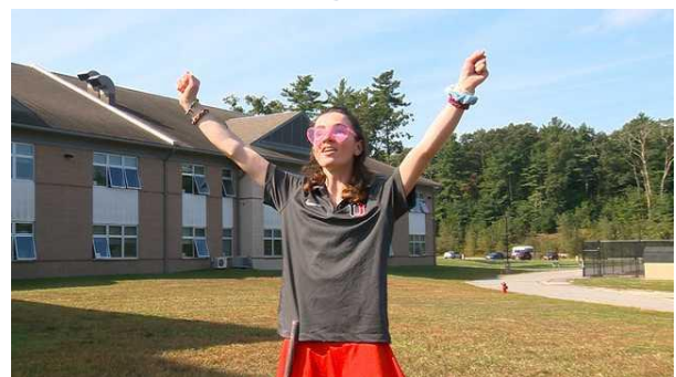
Mass. athlete overcomes traumatic brain injury, returns to competition protection.outlook.com